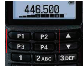
QRK (Quick Recall Key)

Battery Operating Time (Approximately)*1