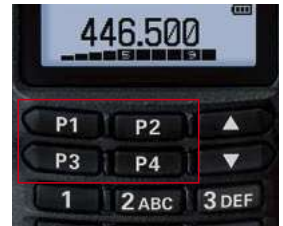
QRK (Quick Recall Key)

Battery Operating Time (Approximately)*1